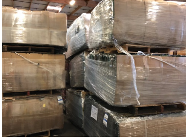
Proper stacking is an important consideration when handling battery-bearing material. Falling or crushed boxes can lead to shorted batteries and possible fires or explosions.

The cheapest solution is having water available in proximity to the fire. Even though the batteries in question do have the word "lithium" in their name, the amount of elemental lithium in the items is limited and water or standard extinguishers can be effective when the fire is small. Some facilities even install water hose stations as an inexpensive measure.