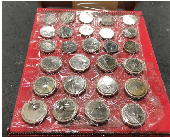
One storage and transport best practice is to isolate terminals with tape.

expecting to triple the output of lithium-ion batteries worldwide. And such growth is expected to accelerate. "The amount you see out there now is nothing compared to what we'll be seeing in the future," Monahan said.